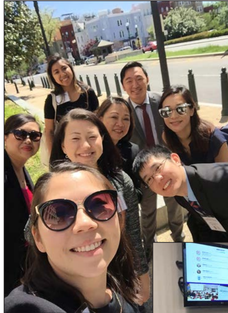
LEFT: JACL OCA LEADERSHIP SUMMIT PARTICIPANTS TAKING A SELFIE ON THE HILL.

I am continuing to find myself as a recently graduated college student, an artist, and a mixed race person. However, this weekend reminded me of two things. One, it's not a sprint, it's a marathon. Work takes time and dedication. What you're doing now doesn't necessarily reflect the rest of your future. And two, fighting for what you're passionate about and the communities that matter to you are essential. These people and issues are what pushes me to make great art and do what I love, and the leadership summit helped me realize that. 🙏